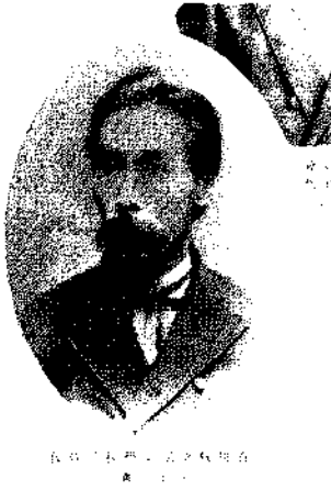
Figure 5 Notomi Kaijiro, director of the Ishikawa Ken Kogyo Gakko , around 1890.

Crafts. To judge from its curriculum (figure 9), the Drawing Department was a kind of design department. The Art Crafts Department concentrated on crafts. The Common Crafts Department was a department of industry and technology, rather than that of crafts. However, what they called Common Crafts was neither mechanical engineering nor chemical engineering. The Common Crafts Department consisted of divisions of dyeing, copper casting, marine products, sewing, lacquering, and pottery making. Therefore, compared with the Art Crafts Department, which consisted of divisions of wax sculpture, drawing for dyeing, pottery painting, wood-stone-ivory sculpture, and embroidery, the Common Crafts department dealt with crafts for the common man. "Futsu" of "Futsu-kogei-bu," the Japanese name of the Common Crafts Department, means "common," "ordinary," "average," or "everyday." For example, both lacquered and marine products were not only a Japanese specialty, but also what Japanese people, average as well as above average, used and consumed every day. The word and concept of "futsu" was important in the history of design education in modern Japan.