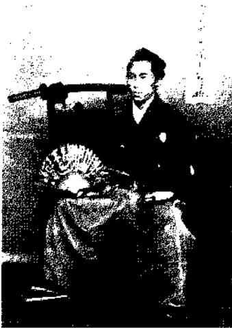
Figure 1 Notomi Kaijiro, immediately before the 1862 Envoy to Shanghai (from Notomi Sensei Dozo Kensetsu in ed., Notomi Sensei Dozo Kensetsu Kinen-cho , 1934).