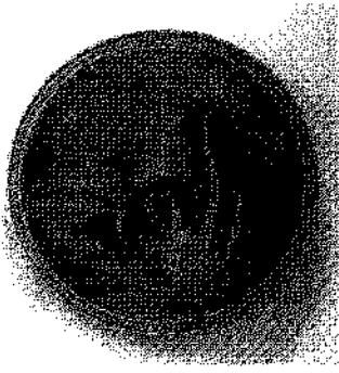
Figure 10 Ornamental wooden tray or "Marugaku- Hakusai-no-zu." (Courtesy of the Kagawa Kenritsu Takamatsu Kogei Koto Gakko).

however, who laid the foundation for it, as has been shown, by not separating design courses from other craft courses, but by uniting them into one in his school curriculum.