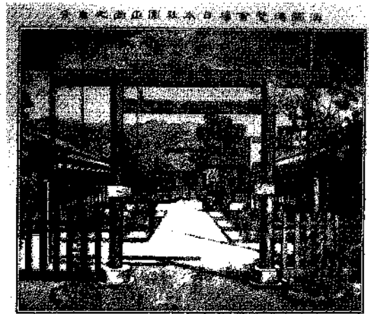
Figure 3 (right)

Japanese delegation to 1873 Vienna World Exposition. Photo taken in Vienna, January 1874 (From O. Umeda ed., Waguneru Tsuikai-shu , 1938). Notomi appears on the right side in front of a column.