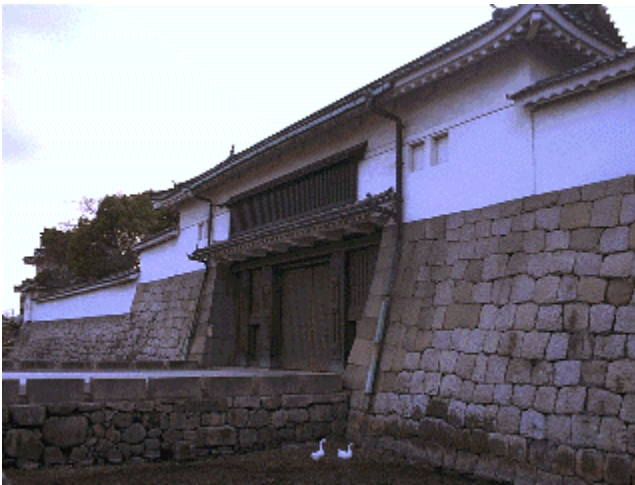
Figure 10- Nijo Castle, the Shogun's Kyoto residence

Katamori's acquisition of the title of Imperial Advisor, along with the four other members of the Yoshinobu-Shungaku "party," was also not a coincidence in this regard—if