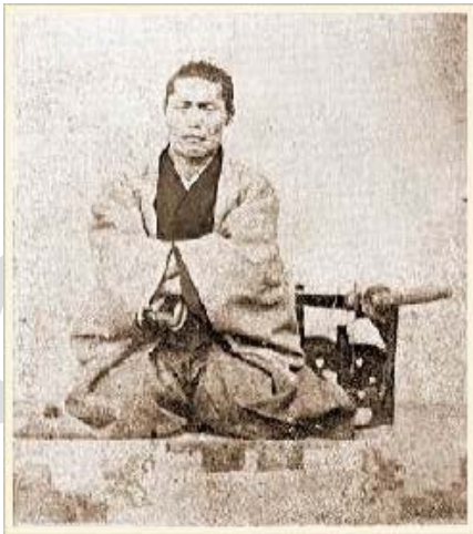
Figure 7- Kondo Isami

I refer of course to the famous Shinsengumi. Led in early 1863 by Kondo Isami (an Edo-based sword teacher) and Serizawa Kamo (a former Mito clansman), they were recommended to Aizu by way of Serizawa's brother, who was a Kyoto-based official of the Mito domain. It was in this small group of only a dozen or so men, then known as