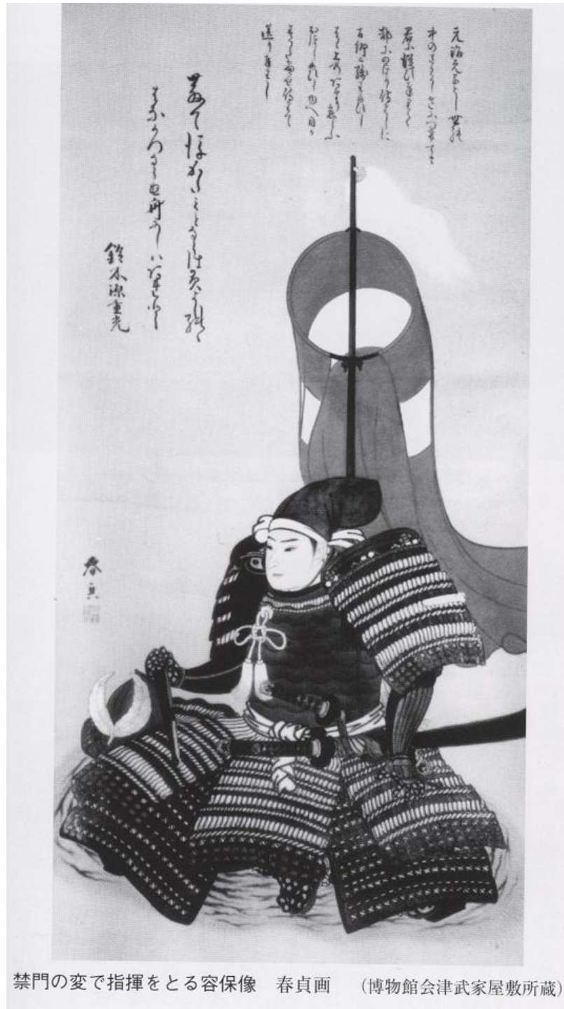
Katamori, summer 1864: in full armor and commanding the Aizu forces at the scene of the Kinmon Incident