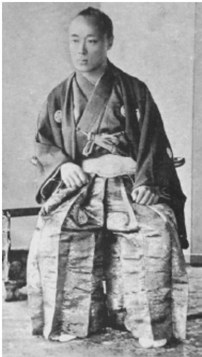
Figure 3- Tokugawa Yoshinobu, 1867

Protector of Kyoto.” 13 The city magistrates of Kyoto, as well as the Shoshidai 所司代 (the Shogun's traditional representative in Kyoto) were increasingly unable to maintain public order in Kyoto, and thus the duties of Shugoshoku were instituted—a position that had as its direct mission the maintenance of public order by military force. Matsudaira Katamori, their close political ally, was the natural choice for the position. Not only did Katamori rule a domain known for its strong martial tradition—a domain which, over the course of its history, had thirty-seven schools of martial arts—but, as