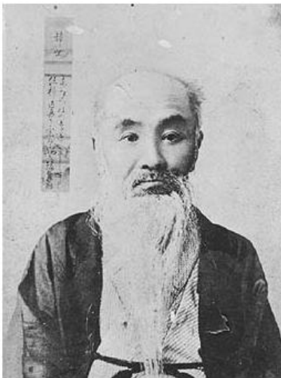
Figure 5- Saigo Tanomo supervised Aizu's coastal defense operations at Shinagawa upon Perry's arrival in 1853

many clan elders in those years, they tried to keep their lord and domain out of the conflict, knowing full well that taking sides would not only bring a high cost in money and manpower, but would inevitably create enemies. In the end, both clan elders and