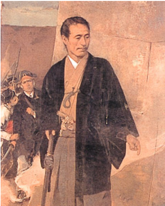
Figure 12- Katsu Awa no Kami Kaishu

The new government, though, would have none of it. Though they had secured Edo Castle peacefully through the efforts of Tokugawa retainer Katsu Kaishu, a large group of discontented Tokugawa retainers and their sympathizers formed the Shogitai, and fought the new government at Rinnoji no Miya’s former residence of Ueno-Kan’eiji. This battle changed the new government’s approach, and the generous settlement that