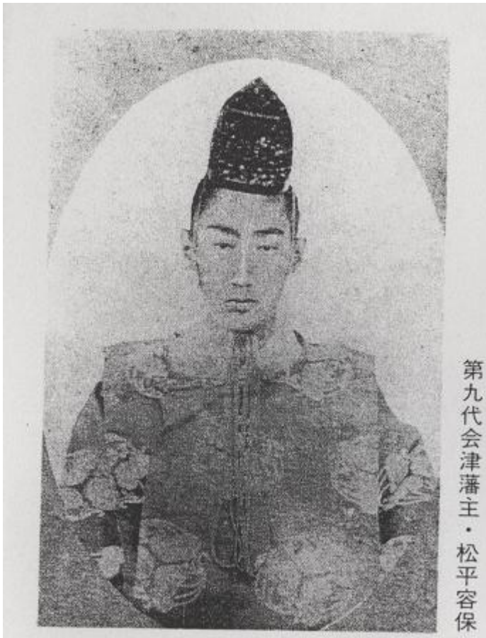
Figure 6- Katamori in Court Costume

In late 1862, Katamori left Edo at the head of 1000 Aizu samurai, heading for his new job in Kyoto. The Shogunate had provided generously for him: he was to receive a “salary” of 50,000 koku , and a loan of 30,000 gold ryo to cover travel expenses. 19 Near the end of the twelfth lunar month, he crossed the Sanjo-Ohashi bridge and entered Kyoto. After paying his respects to the Imperial regent Konoe, he set up his headquarters at Kurotani, in eastern Kyoto. In preparation for his arrival, he had sent vassals ahead in