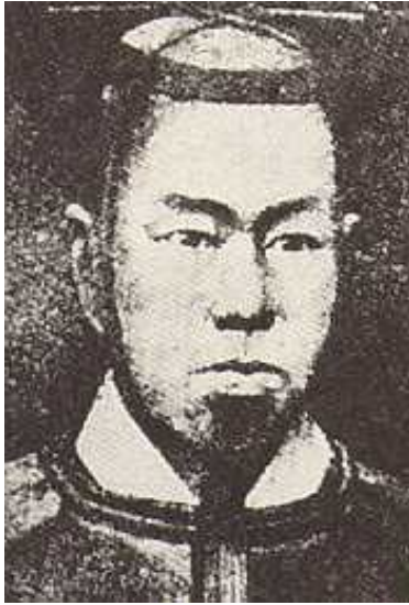
Figure 8- Emperor Komei

part of this incident was the shichigyo ochi 七卿落ち, the flight of seven pro-Choshu Imperial aides. These included the aforementioned Sanjo and Iwakura, among others, all of them escaping to Choshu. Of course the immense conflict that followed resulted in the burning of much of Kyoto, but all the same, Choshu was routed from Kyoto. In recognition for (at least) the accomplishment of this goal of routing Choshu, Emperor Komei presented