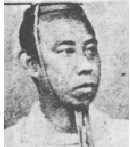
Figure 2- Matsudaira Yoshinaga (Shungaku)