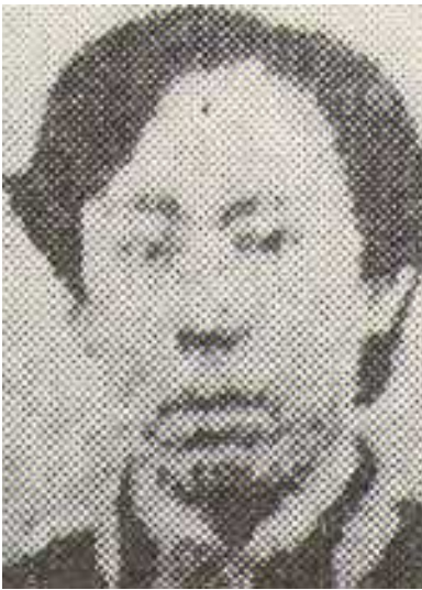
Figure 14- Matsudaira Sadaaki famous, were trained in French-style infantry formation and fighting style.

the form of the Naganuma-ryu tradition of military strategy. However, that system was proven to be inadequate for meeting the southwesterners on anything even remotely approaching equal terms. As with its weapons (a mishmash of American, British, and Dutch equipment), Aizu used a combination of Prussian and French style military organization and structure. The Byakkotai, one unit of which was to later become so