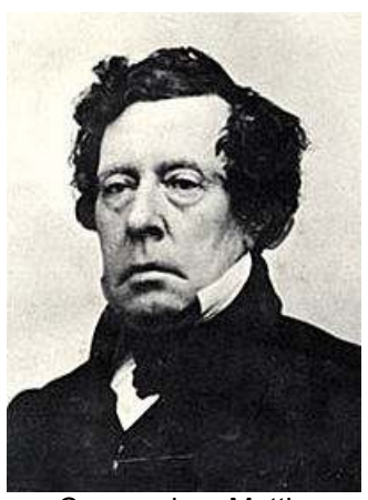
Commodore Matthew Perry, USN

Old enmities can sometimes fester for a long time and this is evident in the way that during this, the Bakumutsu period (幕末), the factions and coalitions aligned themselves, either with the Meiji Court (明治) or the Tokugawa Bakufu (徳川幕府). These alliances had been forged nearly 300 hundred years before in the triumphs and defeats of the crucible of the Battle of Sekigahara (関ヶ原, known as Shinjitai 関ヶ原の戦い). Fought on 21 October 1600 (Keichō 5, 15th day of the 9th month) it established the Tokugawa as the supreme rulers of Japan for the next 265 years, from 1603, when Tokugawa leyasu (徳川家康) was appointed Shōgun (将軍), until 1868 when the Meiji Restoration was declared.