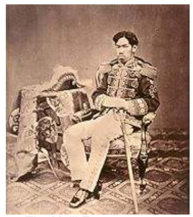
The Meiji Emperor 明治天皇

In 1853 Commodore Perry's Black Ships arrived in Yokohama Bay triggering a series of momentous events that between 1853 and 1867 shook the very foundations of Japanese society, ending their enforced isolation under the Tokugawa Bakufu (徳川幕府) and culminating in 1868 in the Meiji Restoration, (Meiji Ishin 明治維新), the abdication of Tokugawa Yoshinobu (徳川慶喜), the fifteenth and last of the Tokugawa Shōguns (徳川将軍), both of which heralded the end of the Japanese feudal era and its associated societal structure and the beginning of the industrial modernisation of Japan.