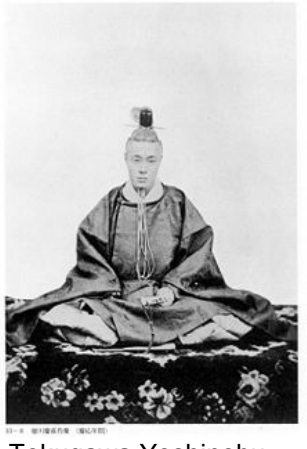
Tokugawa Yoshinobu 徳川慶喜