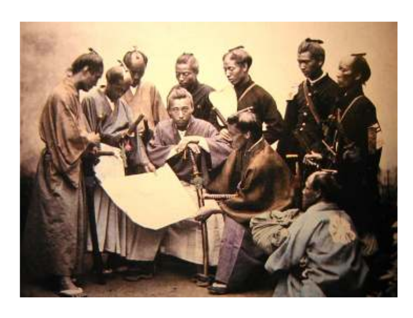
Satsuma samurai during Boshin War (戊辰戦争 Boshin Sensō) period (Hand-coloured albumen silver print by Felice Beato, 1860s)

Many people who may have otherwise remained unknown to history emerged from this period either as heroes or villains, depending on your perspective. Recently the subject of a major television series, the dramatisation of the activities of the Shinsengumi, and their lives and deaths, by NHK (日本放送協会, Nippon Hōsō Kyōkai, the Japan Broadcasting Corporation) has taken Japan by storm. This popular series has seen a resurgent interest in the Shinsengumi (新選組) not only amongst Japanese but also amongst non Japanese interested in the history and the lives of the warriors of Japan.